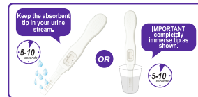
Fig.2 Test in urine stream