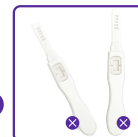
Fig.4 Never hold the test with the absorbent tip pointing upwards during testing.