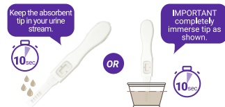
Fig.2 Test in urine stream