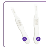
Fig.4 Never hold the test with the absorbent tip pointing upwards during testing.